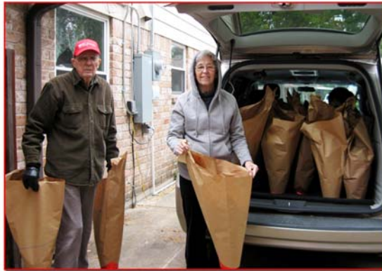
The Mohels load up their van with an order of 36 plants to deliver.