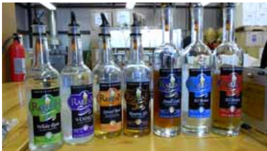
From the Travelers' recent trip to Eagle Point Distillery, home of Railean Rum

For more information about the SPP Travelers, contact Chuck Blesener at ccbles77@gmail.com or 713-683-9945. Chuck sends periodic emails to the Travelers group—send him an email if you'd like to be included in future messages.