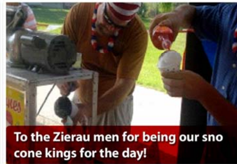
To the Zierau men for being our sno cone kings for the day!