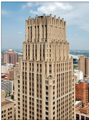
[1922 Gulf Building Now the JP Morgan Chase & Co. Building]

(some beautifully restored, others forgotten gems) as well as lost architecture, which we explore using descriptions and historic photos. Circumstances permitting, the tour ends with a visit to the former Gulf Building (now the JPMorgan Chase & Co. Building), a 1929 masterpiece with some of the city's most magnificent Deco interiors.