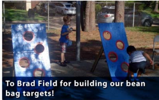
To Brad Field for building our bean bag targets!