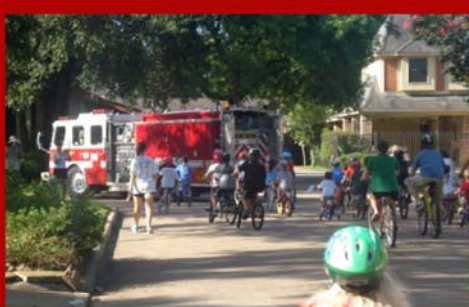
To our local fire fighters and constable for leading the parade! To all our bikers, joggers, stroller pushers, wagon pullers, bike collision picker-uppers (Sarah O.), flag wavers and cheer-us-on-ers!