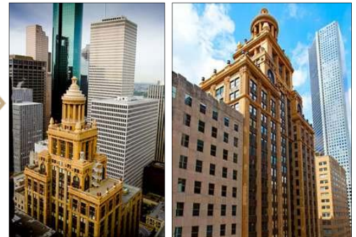
[The Niels & Mellie Esperson Buildings]